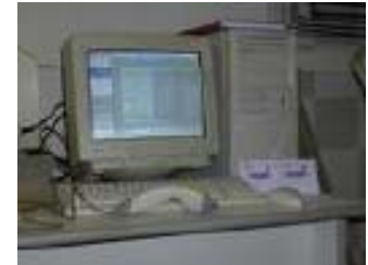
Data is integrated into the policy tracking system.