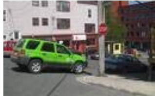
Takes picture of the violation.