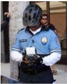
Enforcement officer equipped with PDT and printer.