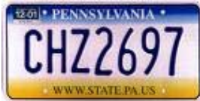
Enters license plate number.