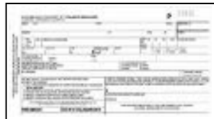
Produces a hard copy of the violation ticket complete with fees.