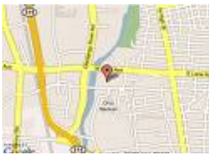
Records the meter ID and/or the violation location coordinates.